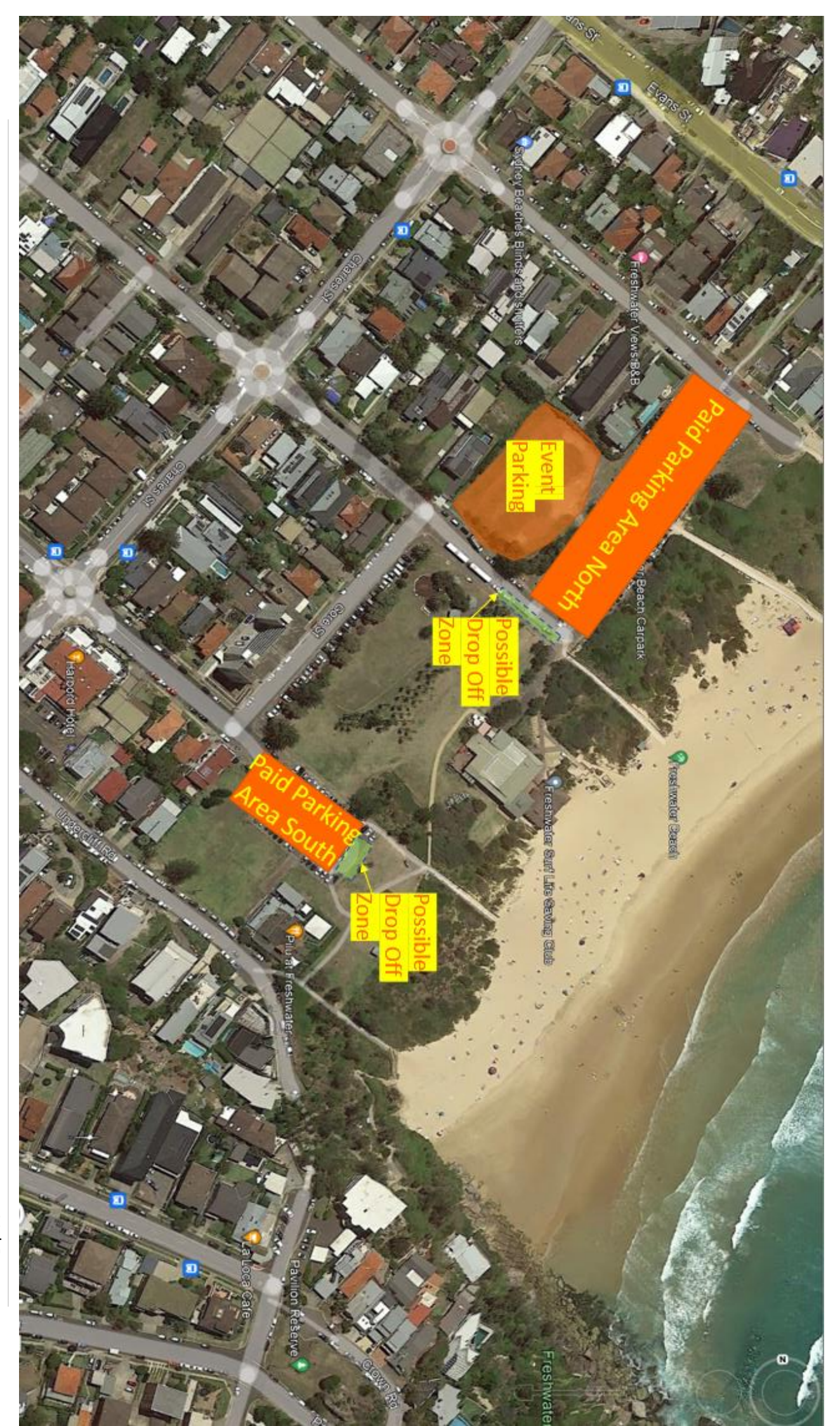
11 | Page